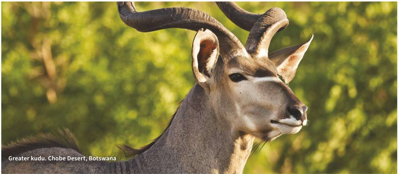
Greater kudu. Chobe Desert, Botswana