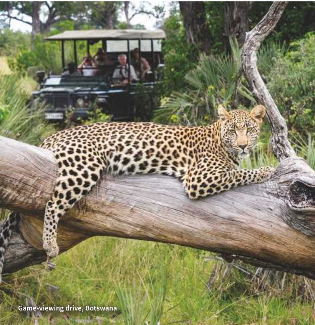
Game-viewing drive, Botswana