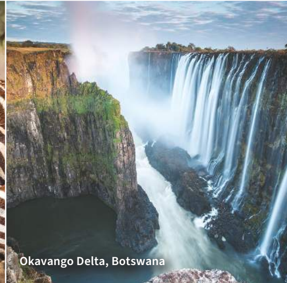
Okavango Delta, Botswana