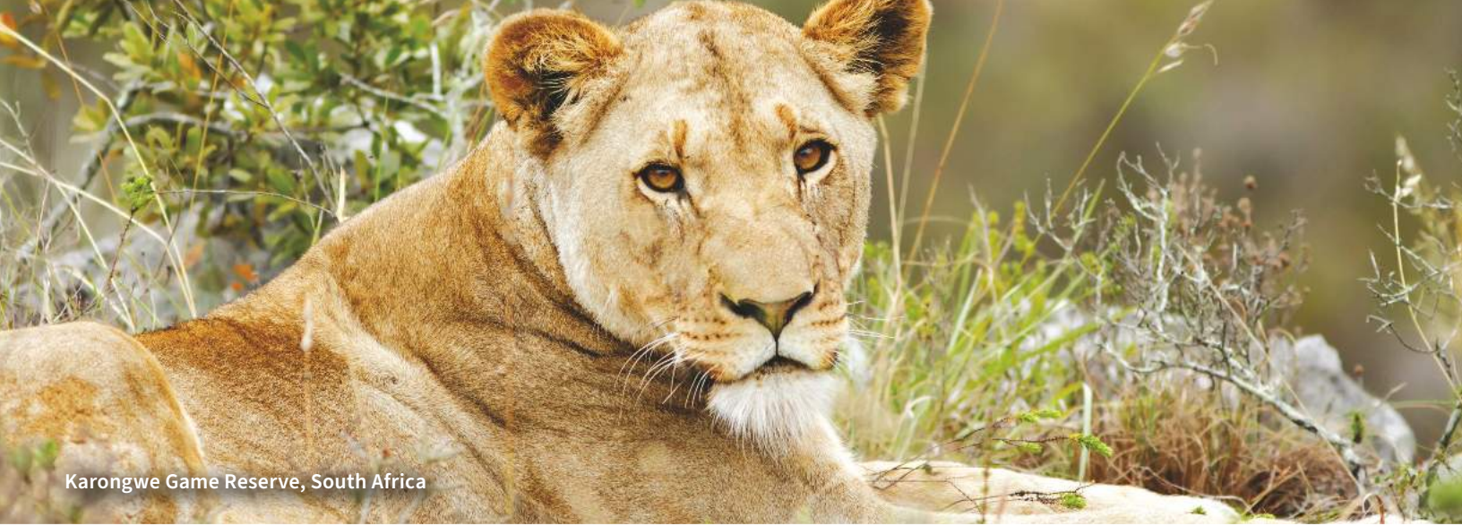
Karongwe Game Reserve, South Africa