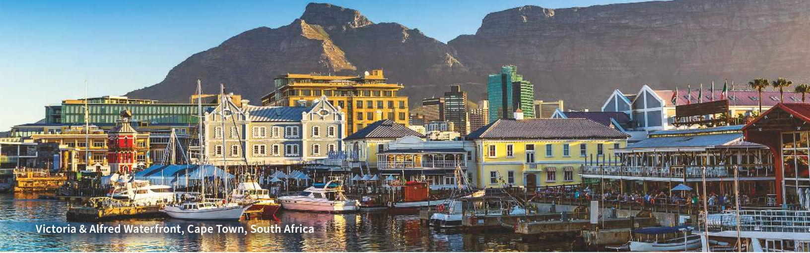
Victoria & Alfred Waterfront, Cape Town, South Africa