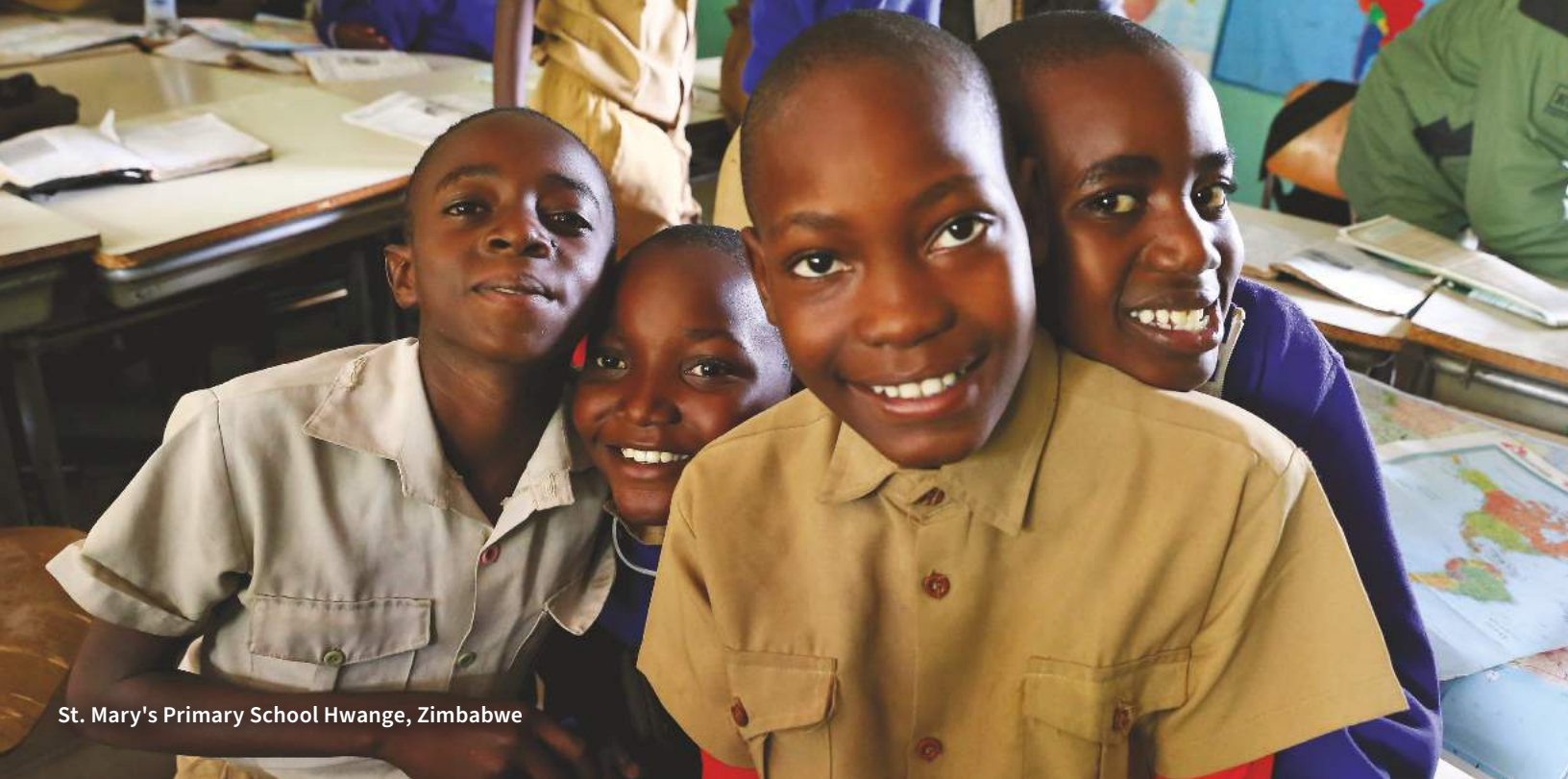
St. Mary's Primary School Hwange, Zimbabwe